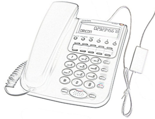
This Telephone Recorder Only Support Analog Telephone system.

LED light turn on red when connected to telephone line, the recorder begins to recording the voice when pick up telephone headset, LED light will flashing one time per seconds. The red LED will turn on, when the phone call coming or pick up the headset, the red LED turn off, and the blue& red LED will flashing each seconds(LED located at micro SD card area);